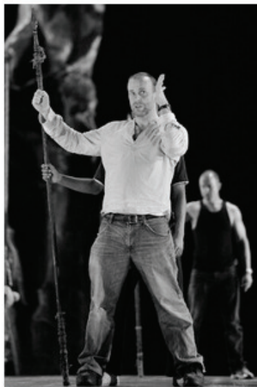
●● David McVicar in rehearsal for Aida, The Royal Opera

He was knighted in the 2012 Diamond Jubilee Birthday Honours List, and in the same year made a Chevalier de l'Ordre des Arts et des Lettres by the French Government.